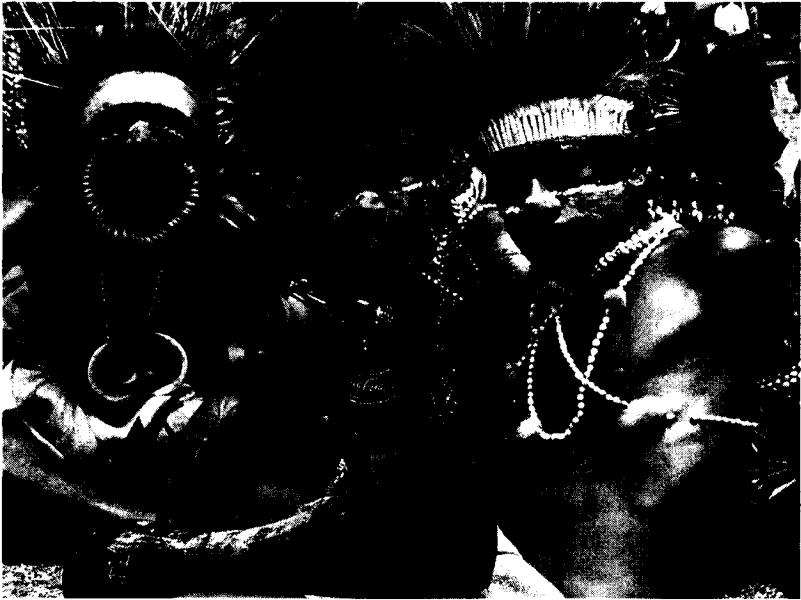
FIGURE 1. Dancers pose at the 2006 Goroka Show, an annual cultural festival held in the Highlands of Papua New Guinea.

The first type of image engages a common ironic and playful qualification of soft drinks as modern complements to traditional ways of life. This example was taken at a popular cultural festival in the highlands of Papua New Guinea (see Figure 1). The second type of image suggests a serious and critical qualification of soft drinks as signs of corporate globalization, as threats to all ways of life. This particular example was taken during a student protest against The Coca-Cola Company at Yale University (see Figure 2). Both types of images raise questions about the limits and possibilities of consumer agency in the economy of qualities for assembling a public around matters of concern.