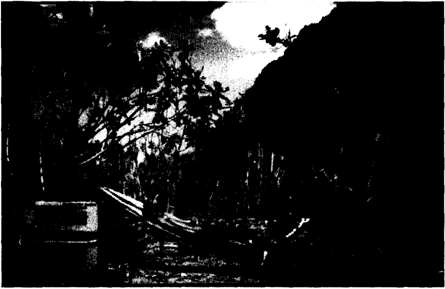
FIGURE 3. Alphonse Hega's second entry for the 1998 Coca-Cola PNG national calendar competition.